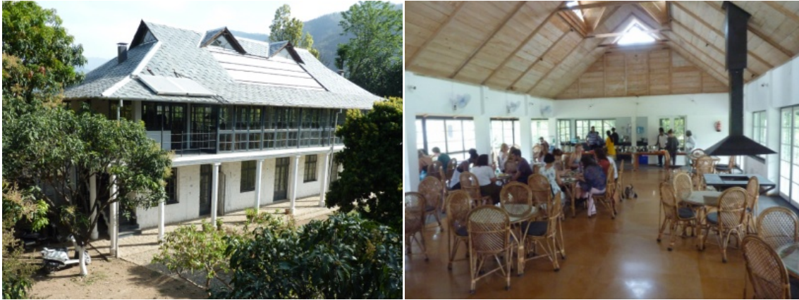
Tarab Ling Dining hall