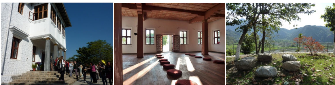
Tarab Ling teaching and yoga building

1 st course (Module I): 9th-15th October, 2023 (7 days x 3.5 hours)–On Zoom 5.30-9pm (Indian Time) and 2 pm - 5.30 pm (European time)