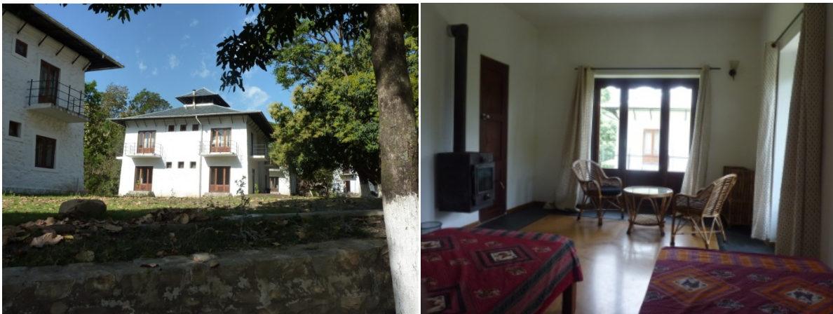
Tarab Ling Guest houses

The UD Training weeks build upon each other and have to be taken in the right order. However, if you are a REPEATER, you may join whichever of the course(s) you wish to repeat, while jumping other courses.